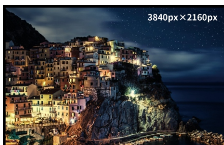
Each port 4Kx 2K/60Hz

You can select the input cards according to your project demands. 2K input cards include DVI, HDMI, VGA, SDI, VGA+SDI(mixed module). 4K input cards include DP/HDMI(mixed module) and DP(2 ports).